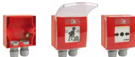
Cable gland optional