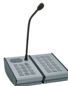
Digital Callstation DCS15 RE with DKM18